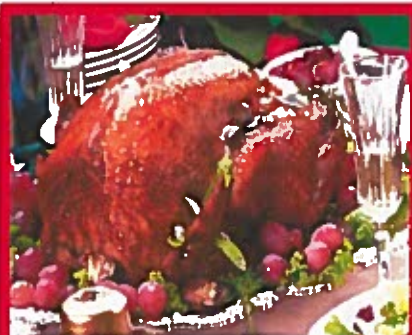
Christmas Day Lunch