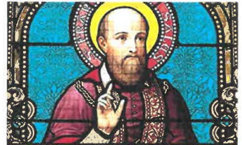
Saint Francis de Sales and the Salesians