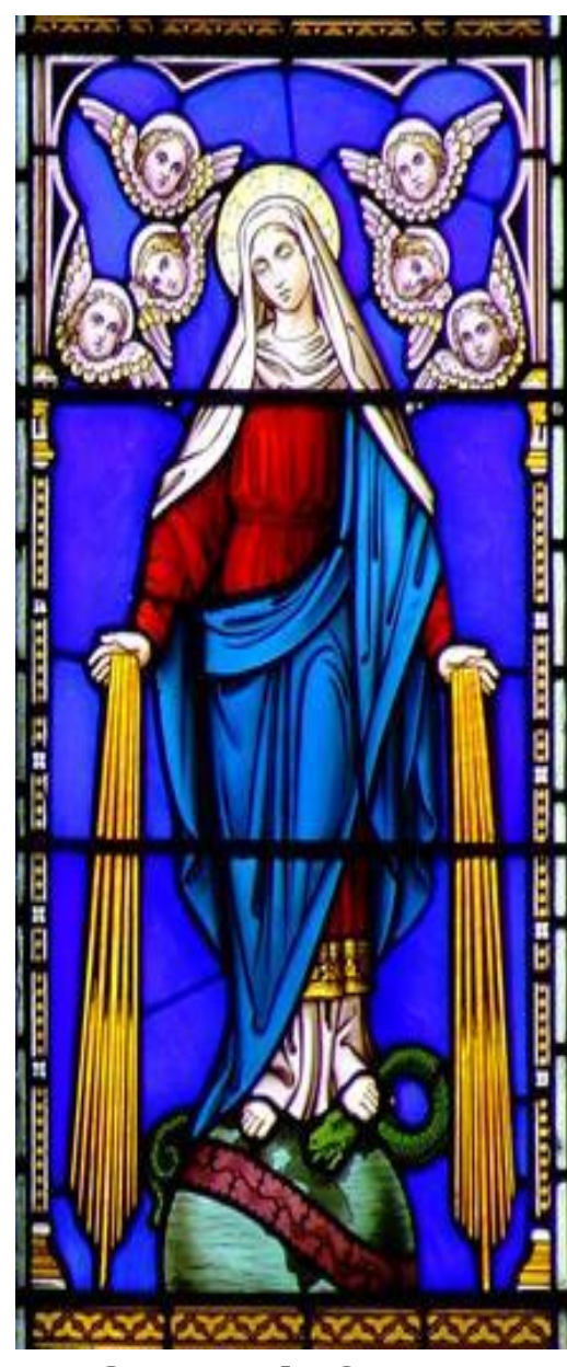
St. Mary's Cathedral Kingston, ON