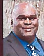
His Eminence Thomas Cardinal Collins (Celebrating the Mass & Homily)