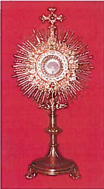
The Blessed Sacrament is exposed in a Monstrance