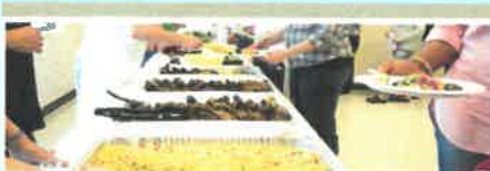
A GREAT DINNER!