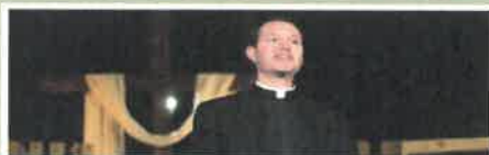
A DVD BIBLE-INSPIRED TEACHING