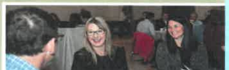
DISCUSSION ON THE TEACHING

THURSDAY EVENINGS, SEPTEMBER 20 TO NOVEMBER 8, 2018