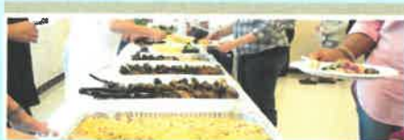
A GREAT DINNER!