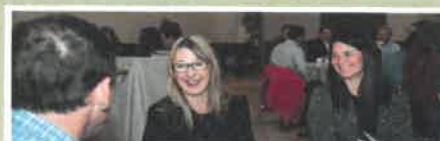
DISCUSSION ON THE TEACHING

THURSDAY EVENINGS, SEPTEMBER 20 TO NOVEMBER 8, 2018