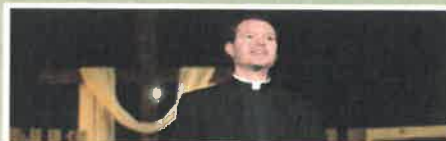
A DVD BIBLE-INSPIRED TEACHING