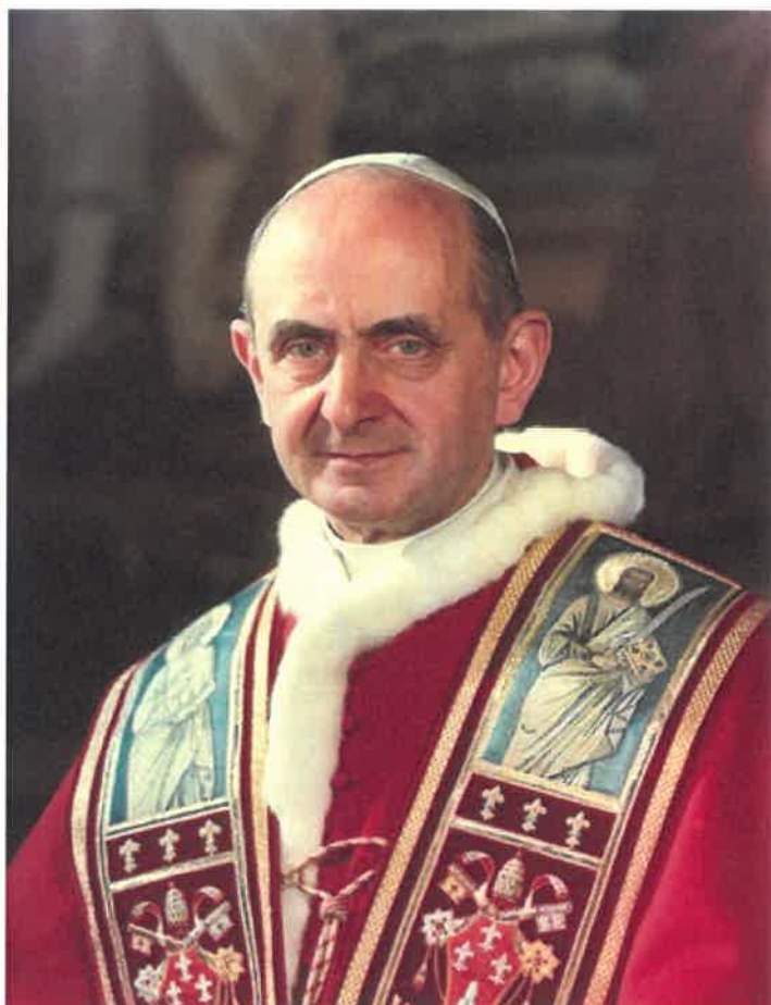
Pope St. Paul VI Canonized October 14, 2018