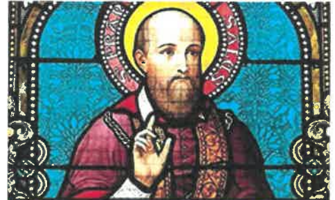
Saint Francis de Sales and the Salesians