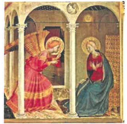
Fra Angelico: The Annunciation

Jesus loved us enough to die for us so that we might live with Him eternally! When we pray the Angelus with humility and love, we are emulating Mary's faith in His goodness. We are blessed in that we can ask both God and His Blessed Mother for their assistance on our journey towards Eternal Life!