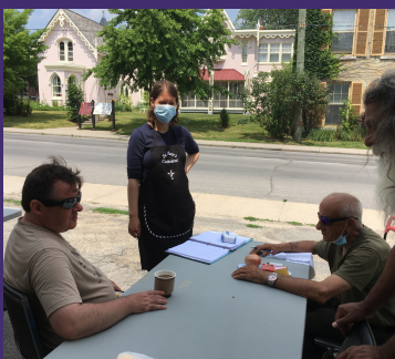
Many of our guests enjoy the famous St. Rita's Cafe patio in the summer!