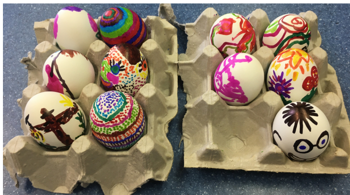
Easter eggs painted by our guests.

An exciting piece of news recently: one of our clients, who is artistically gifted, is creating table centrepieces to decorate tables in our gathering place!