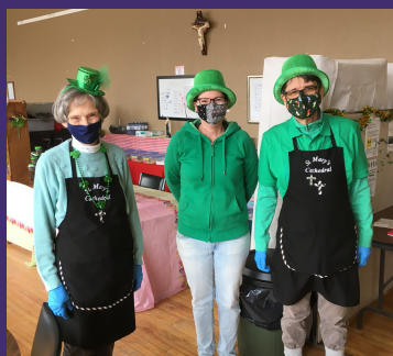
We are so grateful for our wonderful volunteers.