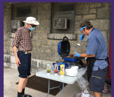
Our BBQ days throughout the summer have become very popular!