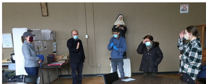
Prayer is always integral to our operations, we pray together after every shift.

"Cooking with Nonna" remains among our most abundant continuous donations, providing nutritious & delicious meals! In addition, some parishioners have volunteered to come on weekday mornings to process the vegetables and freeze them in preparation for the Nonnas. New freezers are needed to store the produce.