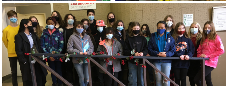
Lenten Outreach project by Ecole Cathedral.

Throughout the summer, the Community Gardens have been in progress. In addition to our large, 2400 sq. ft. garden, we acquired 2 smaller gardens which are being used to grow low maintenance crops. At least 25 volunteers have been working in our gardens, and our produce yield is over 200 lbs more than this time last year. Surplus produce is donated to one of our partners, Lionhearts.