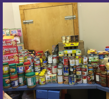
We have been blessed with abundant donations.