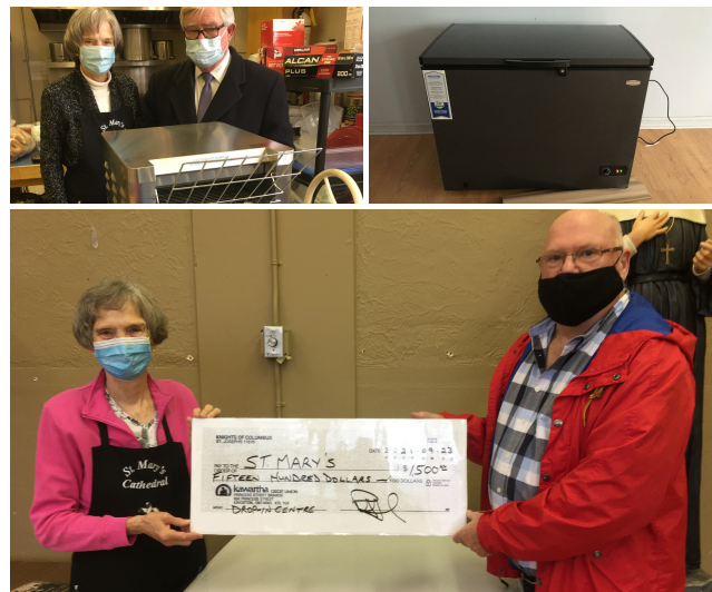
Thank you to the Knights of Columbus (KofC) at St. Mary's and St. Joseph parishes for your generosity

Our events have had great turnout, such as our Christmas Day dinner which transitioned to take-out this year due to COVID restrictions. In spite of this and in freezing rain, we were able to serve 125 people. Some of our events include annual St. Patrick's Day and Easter celebrations!