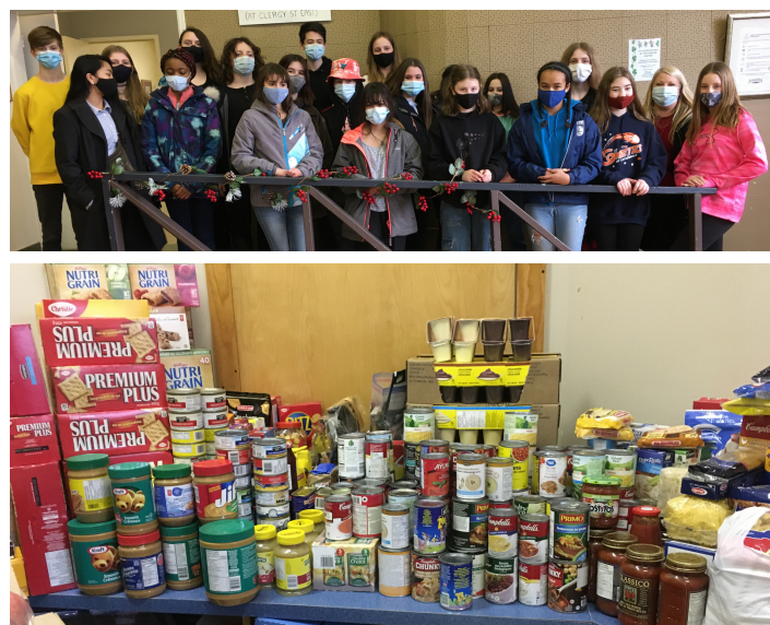
Food items collected by Ecole Cathedral students

We have been blessed by significant donations from our community. Two new freezers were donated by the St. Joseph's KofC, as well as an industrial conveyor toaster from St. Mary's KofC. We also can't forget about the support from the students and staff from local Catholic schools, including our own Ecole Cathedral students!