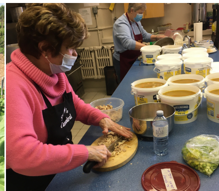
Our community garden and Cooking with Nonna program go hand-in hand!