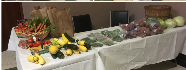
We had two successful vegetable markets, raising $1704.65!

Soon we will begin the process of caring for our community garden plots again. 25 volunteers made the gardens possible last year, as you may have seen the vegetable markets held in 2021. Our Italian Nonnas cooked and froze soup for use this entire winter with the 3500 lbs of produce from the community garden. Our donated freezers accommodated the extra soup from the increased harvest of veggies, and the surplus vegetables we produced were donated to our community partners running other local food programs.