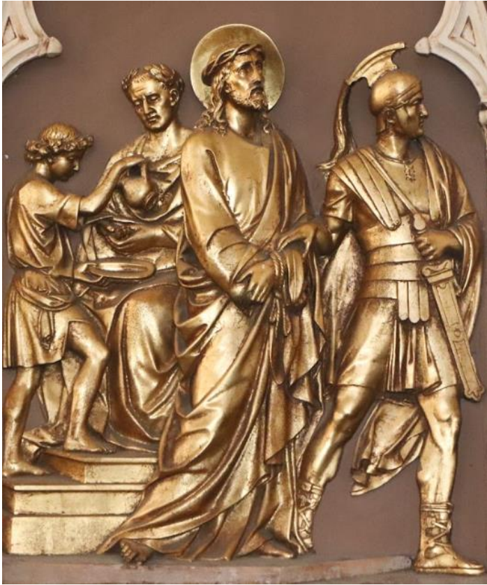
Station I 'Before'

How will you vote? This weekend, please give your answer to the following question. Each person may cast one vote, children included. Voting slips may be found in the pews and dropped in the baskets by all entrances.