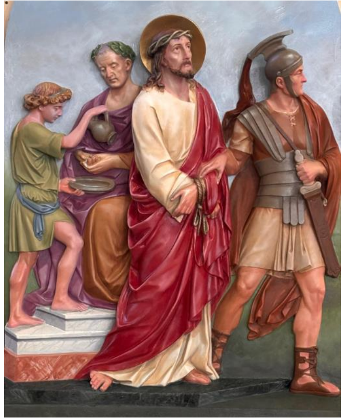
Station I 'After'