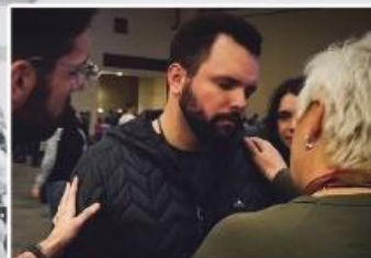
PRAYER TEAMS ESM YEAR 2 STUDENTS & ALUMNI

JESUS PROMISED, "THESE SIGNS WILL ACCOMPANY THOSE WHO BELIEVE...THEY WILL LAY HANDS ON THE SICK AND THEY WILL RECOVER." MARK 16:17