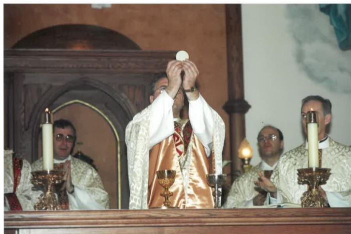
First consecration and elevation.