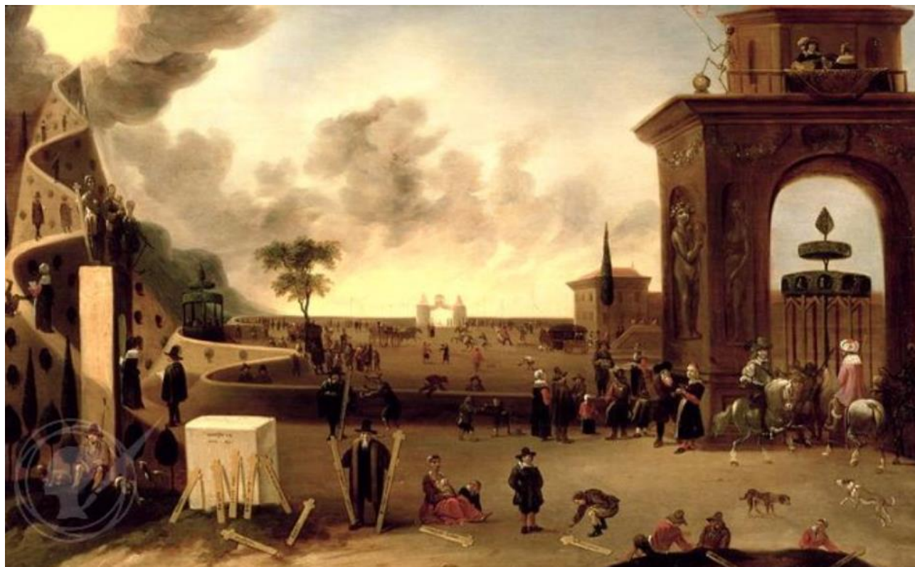
The Narrow Gate, De Bie

279 Johnson Street Kingston, Ontario 613-546-5521 www.stmaryscathedral.ca